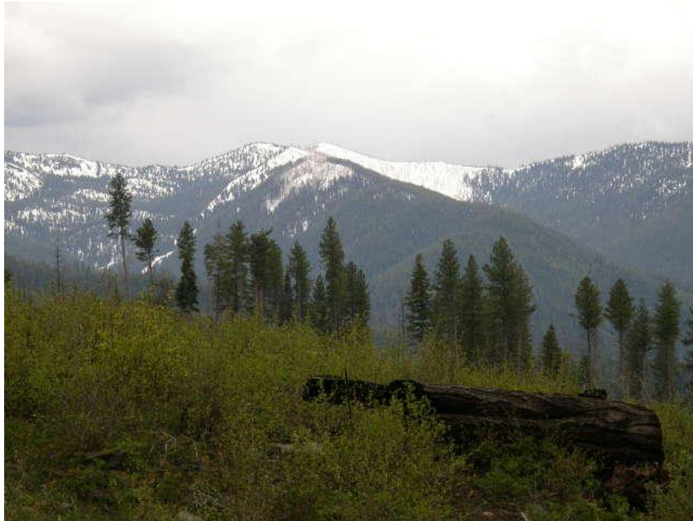
Nez Perce National Forest on transect number NP-2