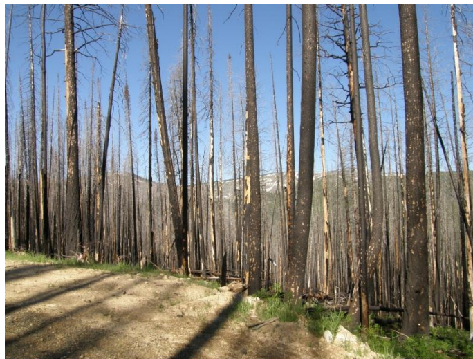
Burned forest on the Nez Perce National Forest